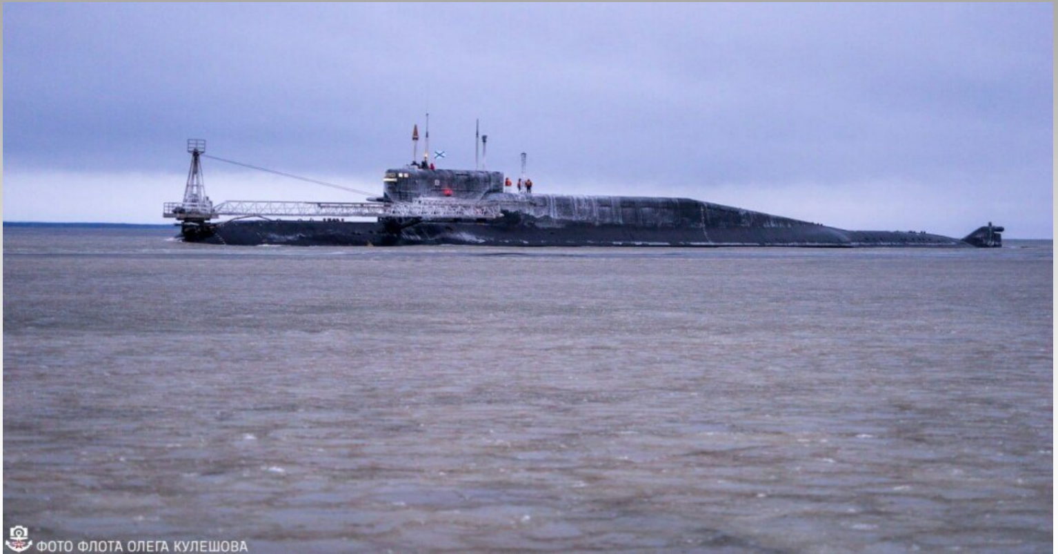
ФОТО ФЛОТА ОЛЕГА КУЛЕШОВА

The K-117 Bryansk sailing the White Sea near Severodvinsk in December. The mast and attached gear to the forward part of the submarine is for sonar calibration. Photo: Oleg Kuleshov