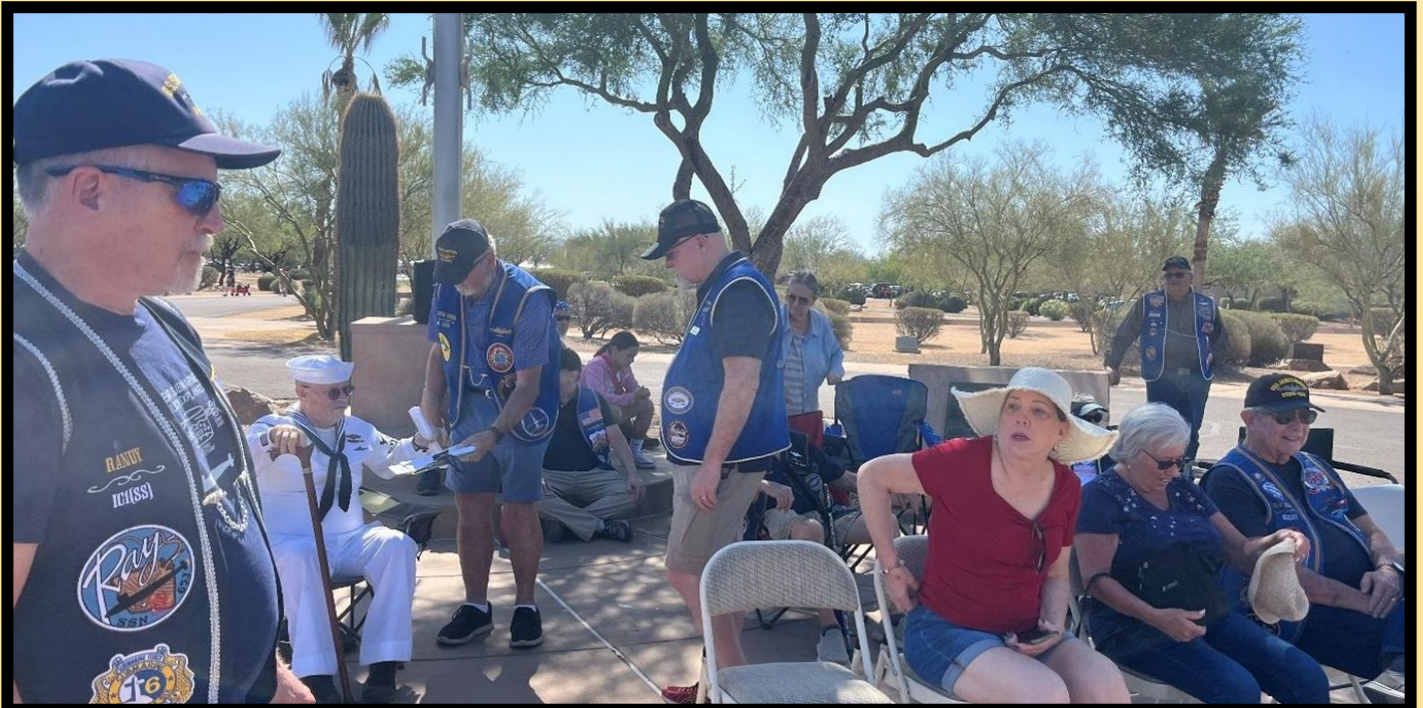
After the Memorial Day Ceremony, Perch Base conducted our Tolling of the Boats Ceremony in the Purple Heart Circle by the WWII Submarine Veterans Mark 18 torpedo.