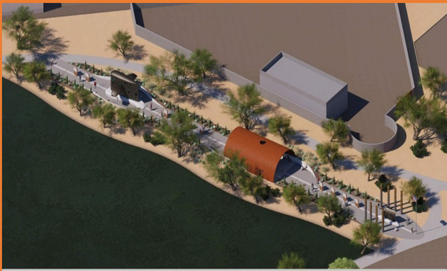
A - Northeast Bird's Eye View