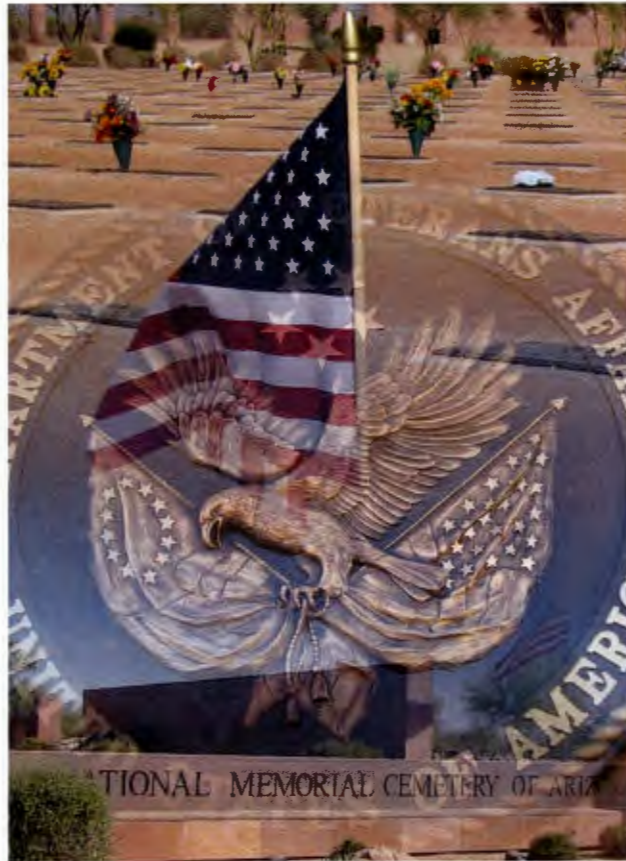
Used with permission PVA Publication – Diane Doyle