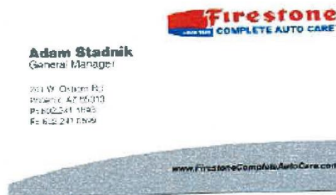
(This card is from the store that graciously gives us space to stage and park for the November Phoenix Veterans Day Parade. Give them a thought if you need tires or service.)

Classified Size Limit: Four lines of 10 pt Arial font, one column wide. Pictures may be included -- and are encouraged -- but make the picture a separate "jpg" or "png" file. If we can't format your ad as a Word document, it won't run.